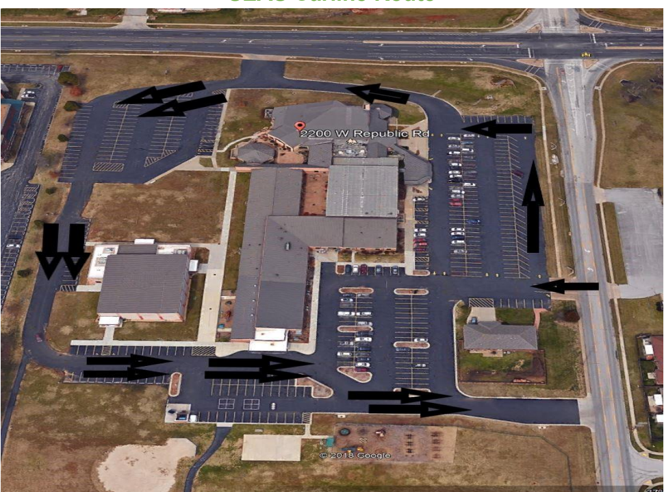
SEAS Carline Route